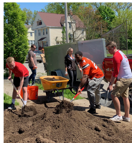
KeyBank employees join Cleveland Browns Running Back Nick Chubb at a neighborhood cleanup in Glenville.

From weeding to painting to teaching to cleaning, KeyBank employees were on the ground helping hundreds of local non-profit agencies.